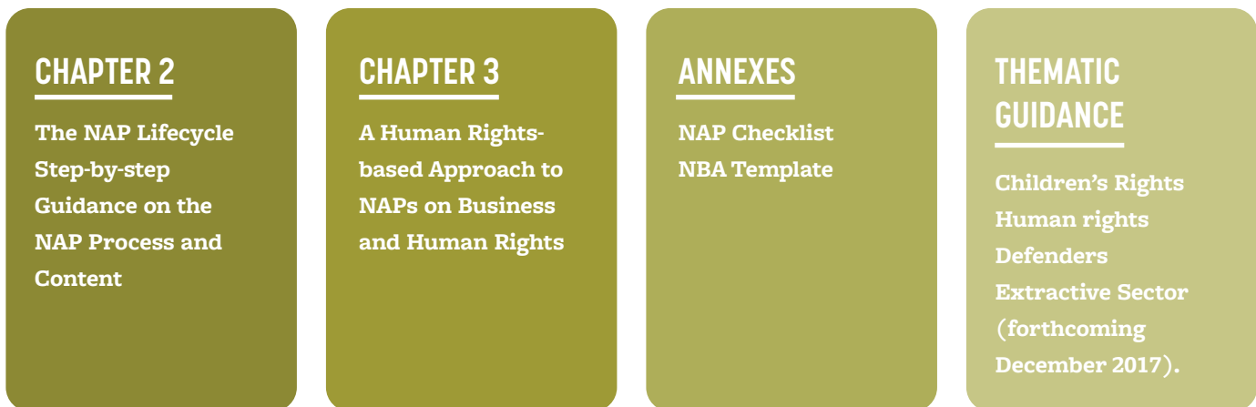
DIAGRAM 1: STRUCTURE OF THE NAPs TOOLKIT